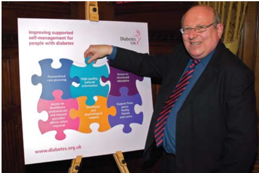
Mike Gapes MP at the World Diabetes Day event in Parliament