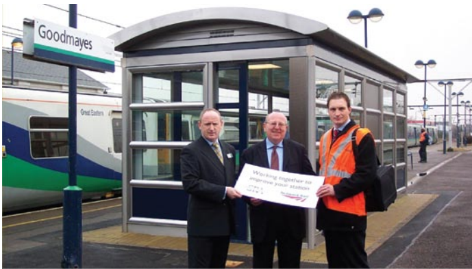
Mike Gapes at Goodmayes station

Mike Gapes is Chairman of the All Party Parliamentary Crossrail Group. He campaigned tirelessly for Crossrail for 20 years. Mike is delighted that the legislation went through Parliament last year and that construction of Crossrail has now started.